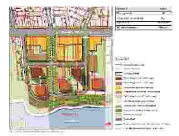
November 8, 2012

We propose mid-rise infill development at this location. We also recommend that the location of the existing public park be clearly identified in the plan. In general, we support the proposed road pattern in this area provided it is not built on lands designed as open space or parkland.