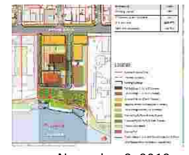
November 8, 2012

<u>Precinct A</u>: 2301 Lake Shore (building in blue) was never expected to be torn down and rebuilt. It was always seen as an opportunity for tower renewal.