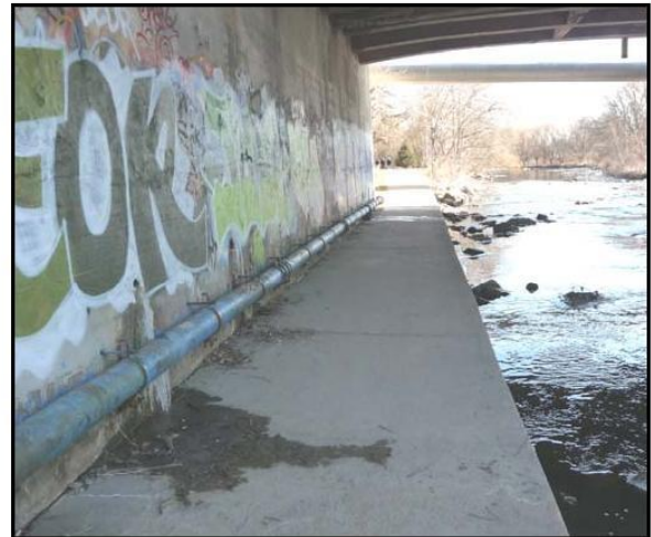
Existing under bridge pathway (looking south) to be upgraded

Your co-operation and patience during the construction period is crucial and appreciated.