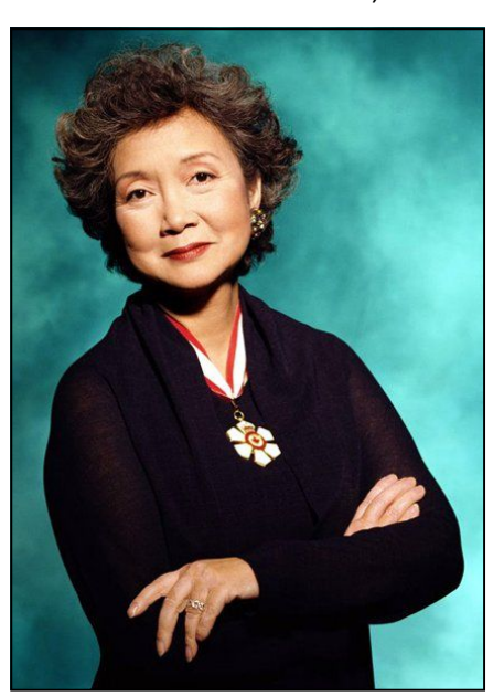
The Rt. Hon. Adrienne Clarkson, Colonel-in-Chief of the Princess Pats

They're called the Princess Patricia's Canadian Light Infantry, and they're noted for being the first Canadian regiment to arrive in Europe in the early months of World War I. The PPCLI is also one of only three regiments of the Canadian Armed Forces made up of full-time, active duty soldiers. (Most other regiments in Canada are reserve battalions.)