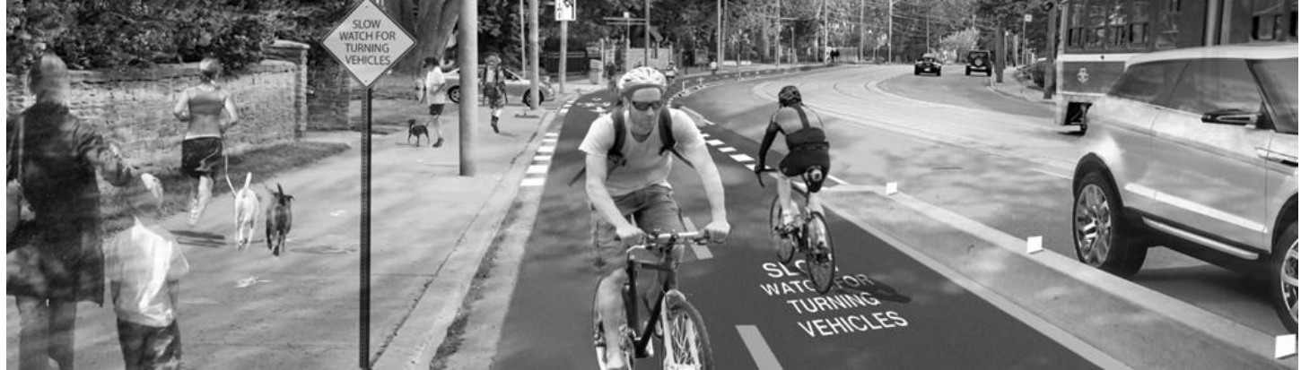
Illustration of the proposed Lake Shore Boulevard West Cycle Track design.

The City of Toronto is planning a new 1.4km cycle track along Lake Shore Boulevard West, from Norris Crescent to First Street, in Etobicoke, Ward 6. The new cycle track will provide a safe connection for cyclists, and will close a gap in the Waterfront Trail. We invite you to attend a public open house to learn more about the proposed design, ask questions, and provide feedback.