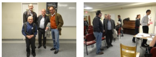
Mimico Residents Association AGM, March 31, 2016