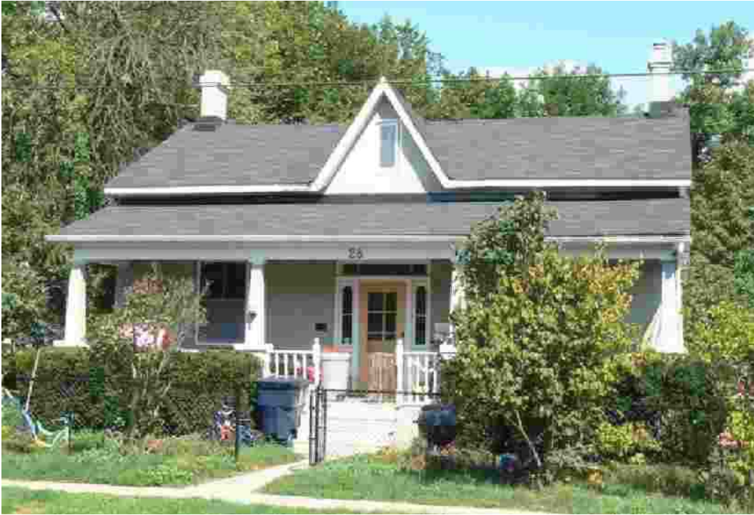
28 Daisy Avenue – South View