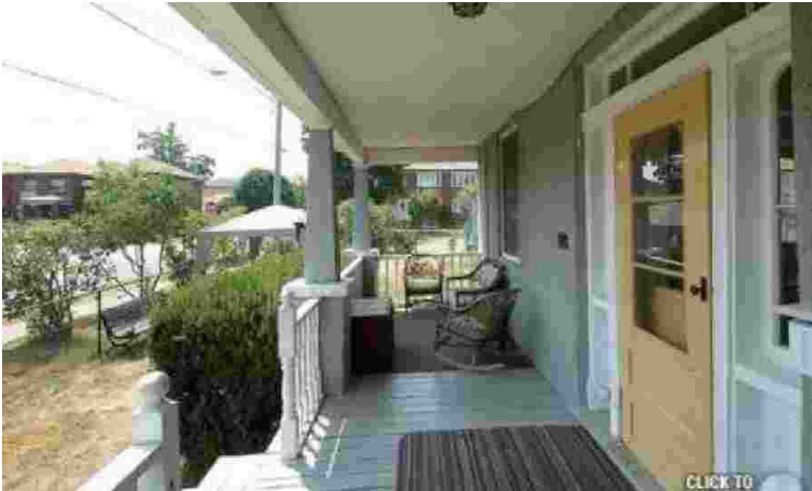
28 Daisy Av. – Exterior view of verandah & front door