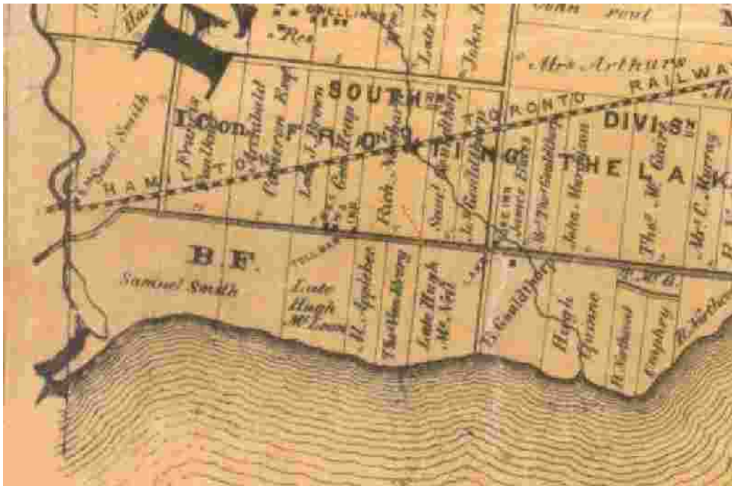
Tremaine's 1860 Map of Etobicoke – see red arrow for Richard Newborn property