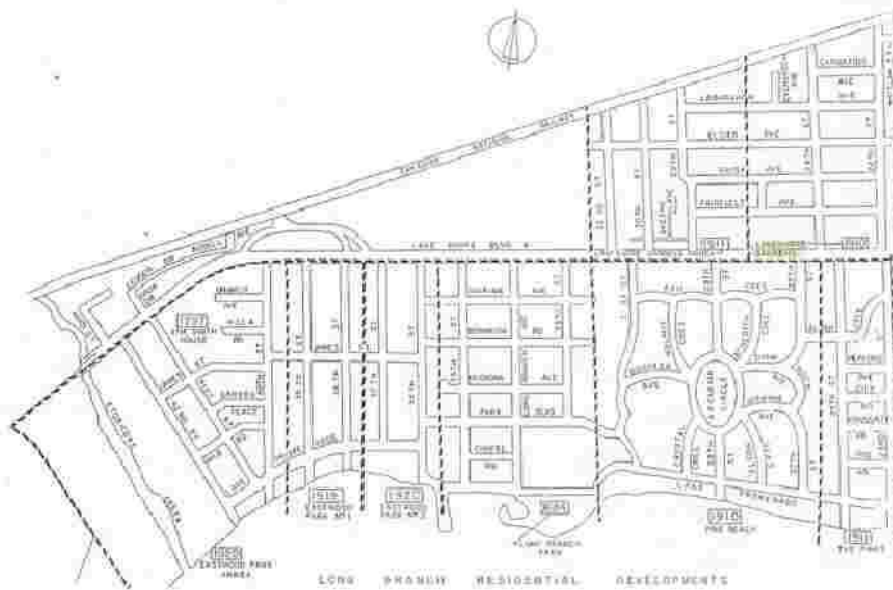
Lakeshore Gardens subdivision is in top right corner of above map