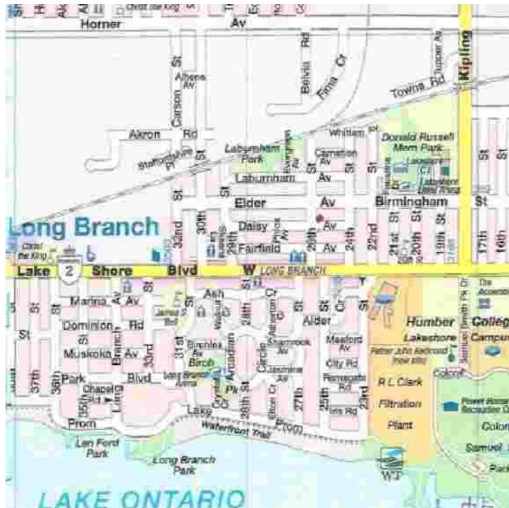
See red dot for location of 28 Daisy Avenue at northeast corner of Daisy Avenue and Twenty Sixth Street