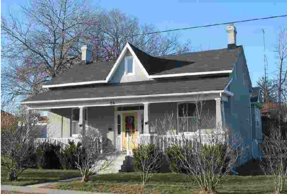
28 Daisy Avenue – Southeast View