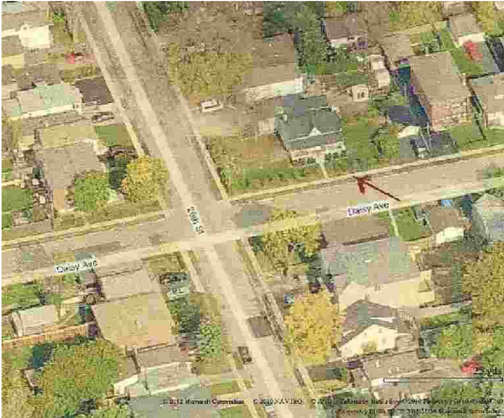
Aerial View of 28 Daisy Avenue in 2010 – see red arrow