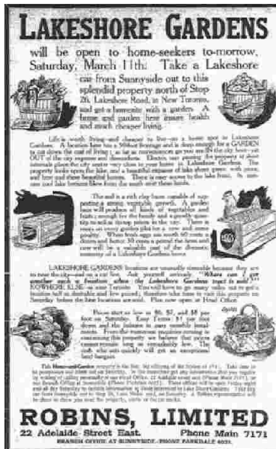
Ad for Lakeshore Gardens in Toronto Daily Star, March 10, 1911