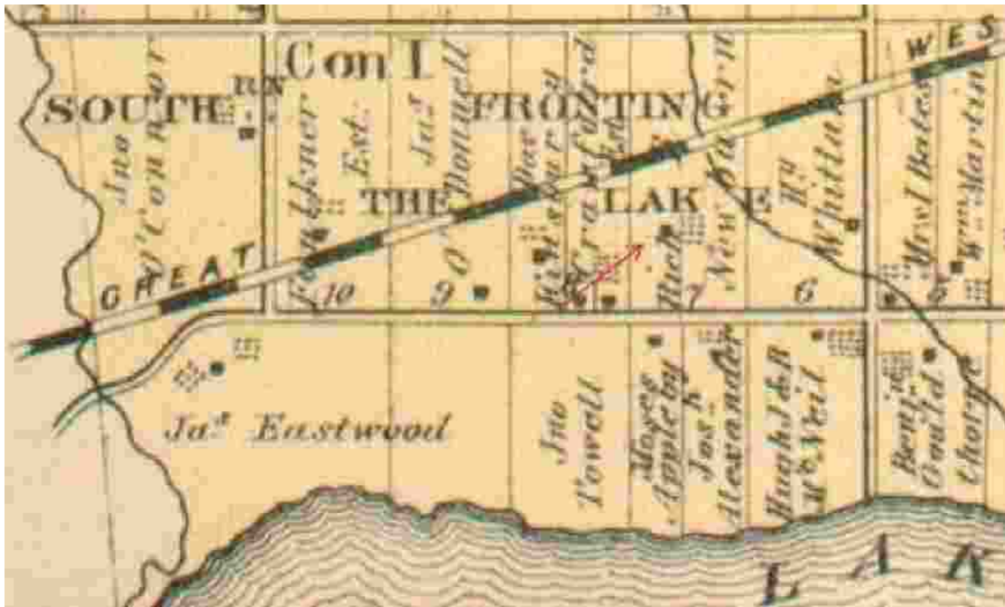
Miles 1878 Map of Etobicoke – See red arrow for Richard Newborn property