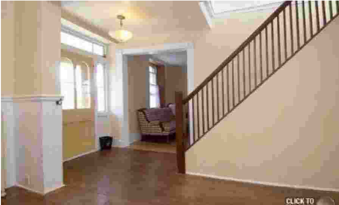
28 Daisy Avenue – Interior view of front door. Also shows two foot thick exterior walls