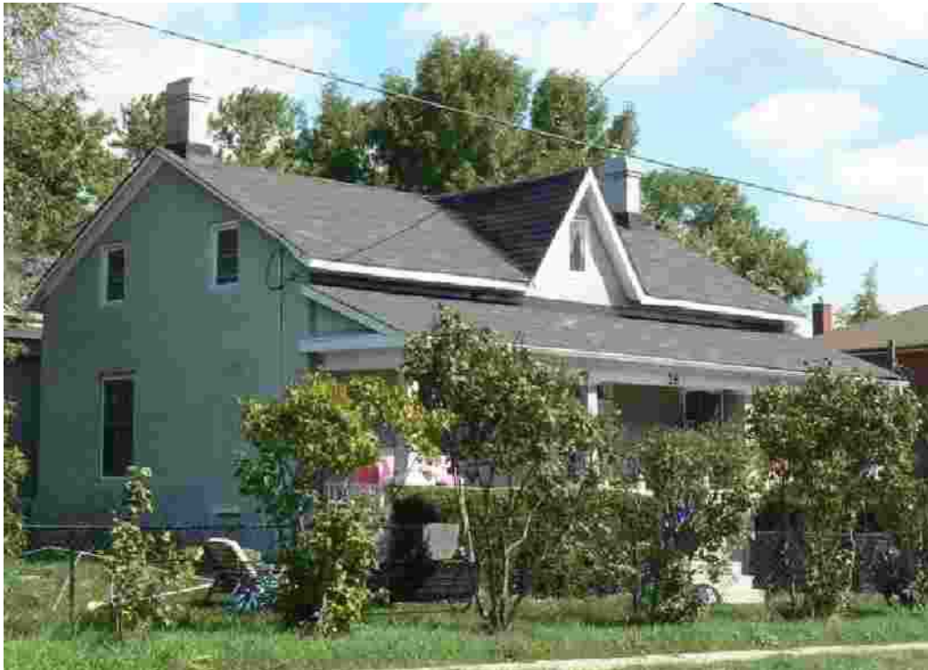
28 Daisy Avenue – Southwest View