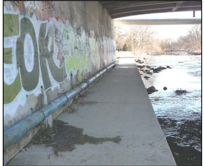
Existing under bridge pathway (looking south) to be upgraded

Further notice will be given prior to construction with a more accurate start date and other information regarding the work. Your co-operation and patience during the construction period is crucial and appreciated.