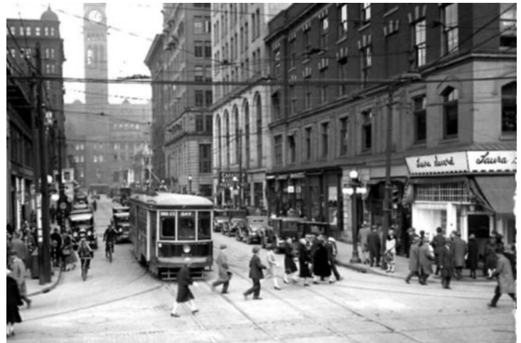
In prim black and white livery with lace-curtained windows filled with trays of chocolates, Laura Secord shops were designed to stand out from their more sombre neighbours. The one at Bay and Adelaide streets in Toronto, seen here in 1927, operated until the mid-1950s. Beyond, at the head of Bay Street, is the clock tower on City Hall and a turret on the Foresters’ Temple Building.