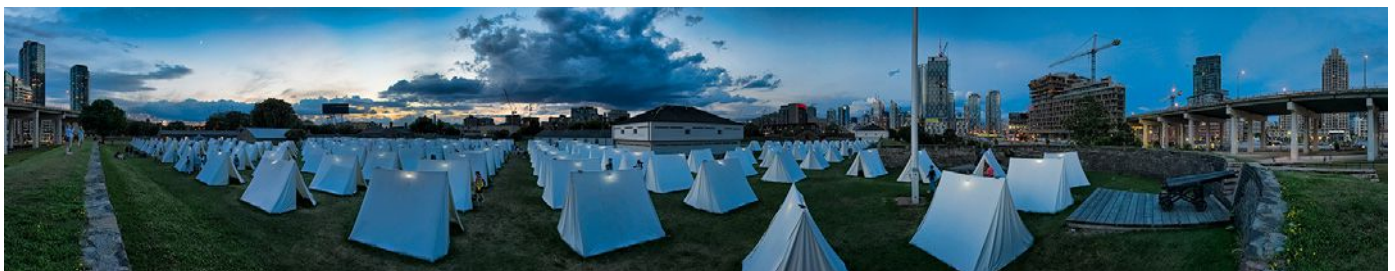
Panorama of The Encampment installation at Fort York during Luminato 2012.