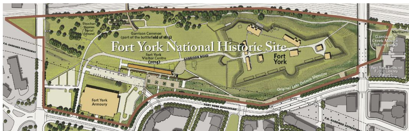
Landscape Master Plan for Fort York National Historic Site. Prepared by DTAH, Toronto, 2012.

Working with the Toronto Parking Authority, we have recently implemented a 'Pay and Display' parking system at Fort York. Given our location in downtown Toronto, with many other major tourist destinations in the vicinity and 6000 new units of housing to the immediate south, the need to implement such a system was pressing. The objective is to keep the small amount of parking that we have priced reasonably, but available at all hours. The majority of net revenues from the parking operation will be directed back towards programming at Fort York.