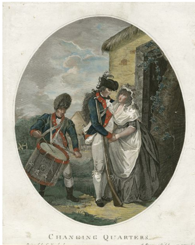
George Morland's depiction of lovers parting captures the sacrifice made by British soldiers posted abroad. Only six wives in a hundred, selected by lottery, were allowed to accompany their husbands; the rest stayed home. Couples lived together in the barracks, where the women took care of washing, cooking, and sewing. Hence, most soldiers functioned as single men.