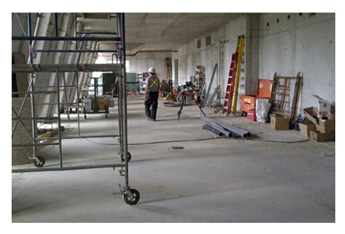
About 80% of the concrete shell of the Visitor Centre has been poured, and the interior spaces are now taking shape.

David Spittal, senior project coordinator for the Visitor Centre, reports that over 80% of the Visitor Centre's concrete shell, including the building façade and roof, is complete. Mechanical equipment has been delivered, and electrical and other site-servicing work continues. For those visiting the site, our General Contractor, Harbridge + Cross, has installed the first weathered steel panel at the far west end of the building. This first panel was installed early as a test panel. The building itself is expected to be substantially complete by the end of May 2014, with exhibit installation and landscaping scheduled over the summer months. An official opening date has yet to be finalized.