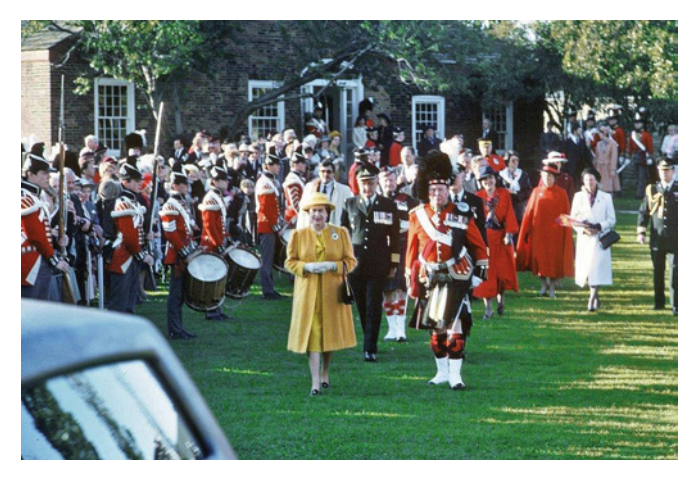
HM Queen Elizabeth's visit to Fort York in September 1984, on the occasion of Ontario's Bicentennial and Toronto's Sesquicentennial, underlined the fort's links with the Crown. Here she is seen leaving the Officers' Mess.

celebrations. Queen Elizabeth II visited Fort York for a garden party from 4 to 5:20 pm on September 29, also hosting a luncheon in the Officers' Barracks and Mess Establishment.