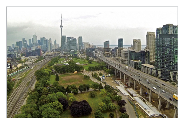
An aerial view of the fort looking east shows the substantial progress on the Visitor Centre that's been made over the summer.

TD Bank Group also donated $50,000 towards supporting War of 1812 Bicentennial educational programs at the City's historic sites. Participating museums include Fort York, Mackenzie House, Colborne Lodge, Montgomery's Inn, and Gibson House. The donation makes it possible for students of the Toronto District School Board and the Toronto Catholic District School Board to attend the educational programs at no cost. Almost 2000 students have already participated in the program, which will continue through June 2014.