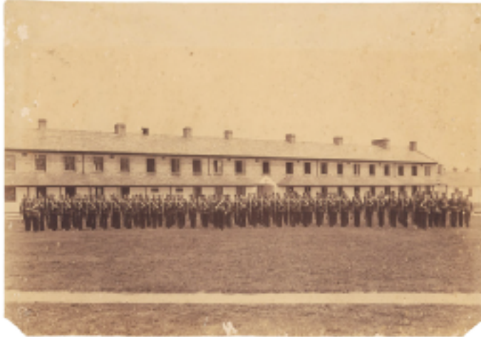
The men of “C” Company, Infantry School Corps, form up on the parade square at the New Fort, Toronto, in 1888.