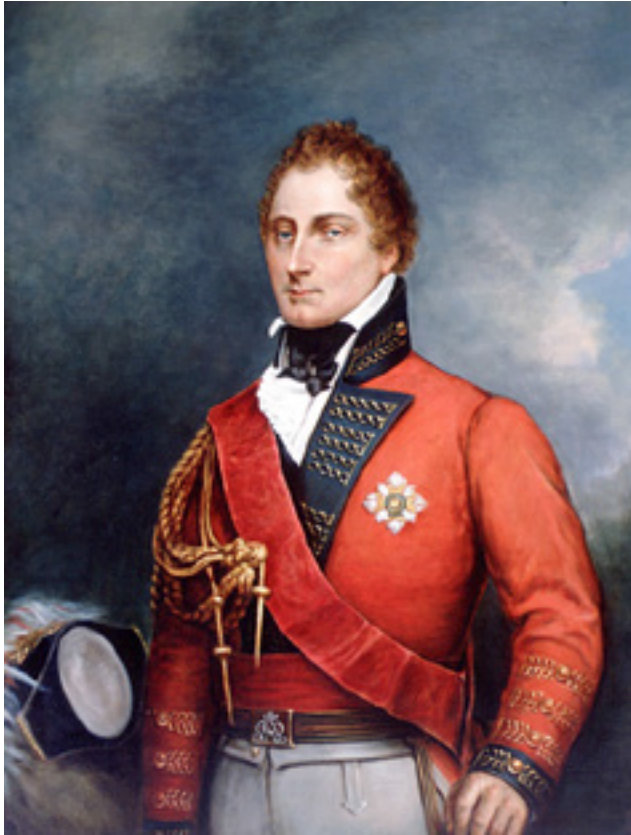
George-Theodore Berthon, Portrait of Lieut. General Gordon Drummond, Administrator of Upper Canada, 1813-1815.

Mar. 30 An invading force of 4000 American regulars was repelled at the second Battle of Lacolle in Lower Canada.