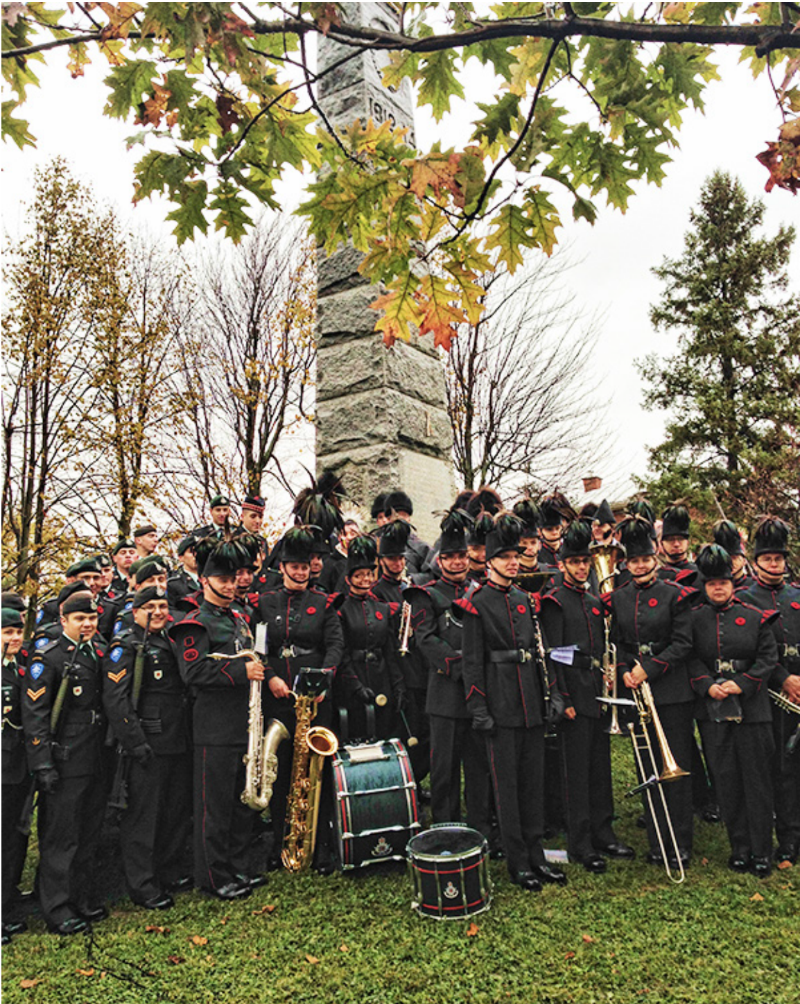
La Musique des Voltigeurs de Québec in plumed hats, a lone Kahnawake warrior in the rear, and soldiers from reserve units sharing the battle honour “Châteauguay” surround