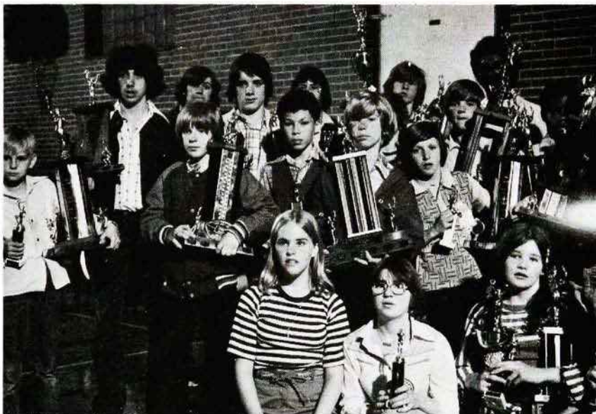
The kids from the Point: sometimes winners.