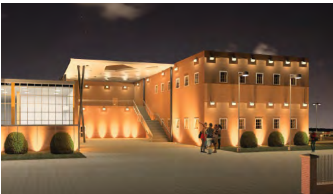
Design concept from the students at Sheridan College in the Architectural Technician/Technology program.

Sheridan College – The Faculty of Applied Science and Technology staff from the College's Architectural Technician/Technology program are using the Small Arms Building and site for their Emerging Building Technologies class over the 2016 summer semester. Students will use the site for producing novel design solutions for the building. In the fall of 2016, the Sheridan Architectural Technician/Technology program will move to the Hazel McCallion Campus in Mississauga and staff are interested in developing a long-term relationship with SAS and other agencies collaborating at the site.