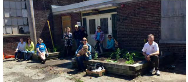
Planting of the garden beds at the Small Arms Building.

SAS has been working with Ecosource who have proffered their expertise on developing community gardening projects. Volunteers, primarily from the Lakeview Community have been working industriously using indigenous plants and donations to upgrade and maintain six of the garden beds and the garden area on the west side of the building.