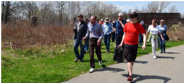
Small Arms Jane's Walk led by City of Mississauga Ward One Councillor Jim Tovey.

In early April Councillor Tovey launched the demolition/restoration of the building with the assistance of Habitat for Humanity undertaking the initial demolition of the great hall area of the building. Guest dignitaries included MP Stella Ambler, MPP Charles Sousa and Mayor Bonnie Crombie.