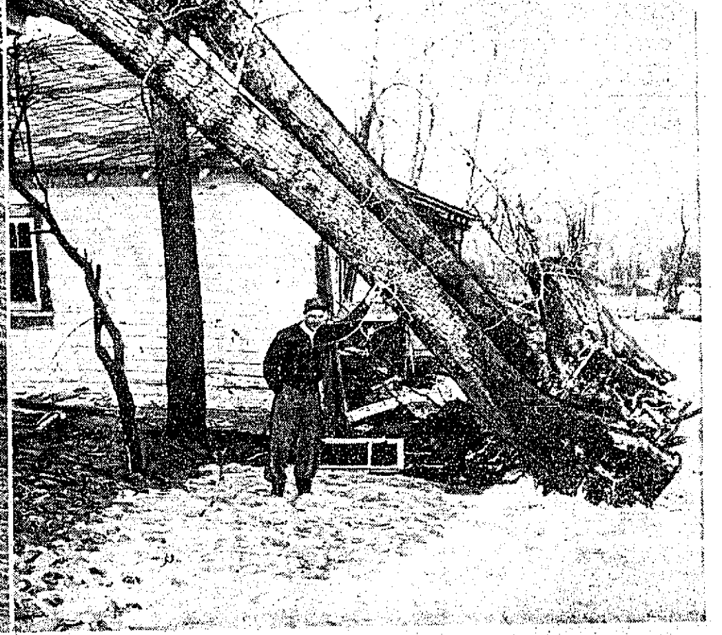
TREES WERE UPROOTED at Lake Promenade, in Long Branch, and many fell over homes, crushing them. Rich farmlands and public utilities from Windsor to 50 miles east of Toronto suffered extensive damage. Wind storm was one of worst in decades