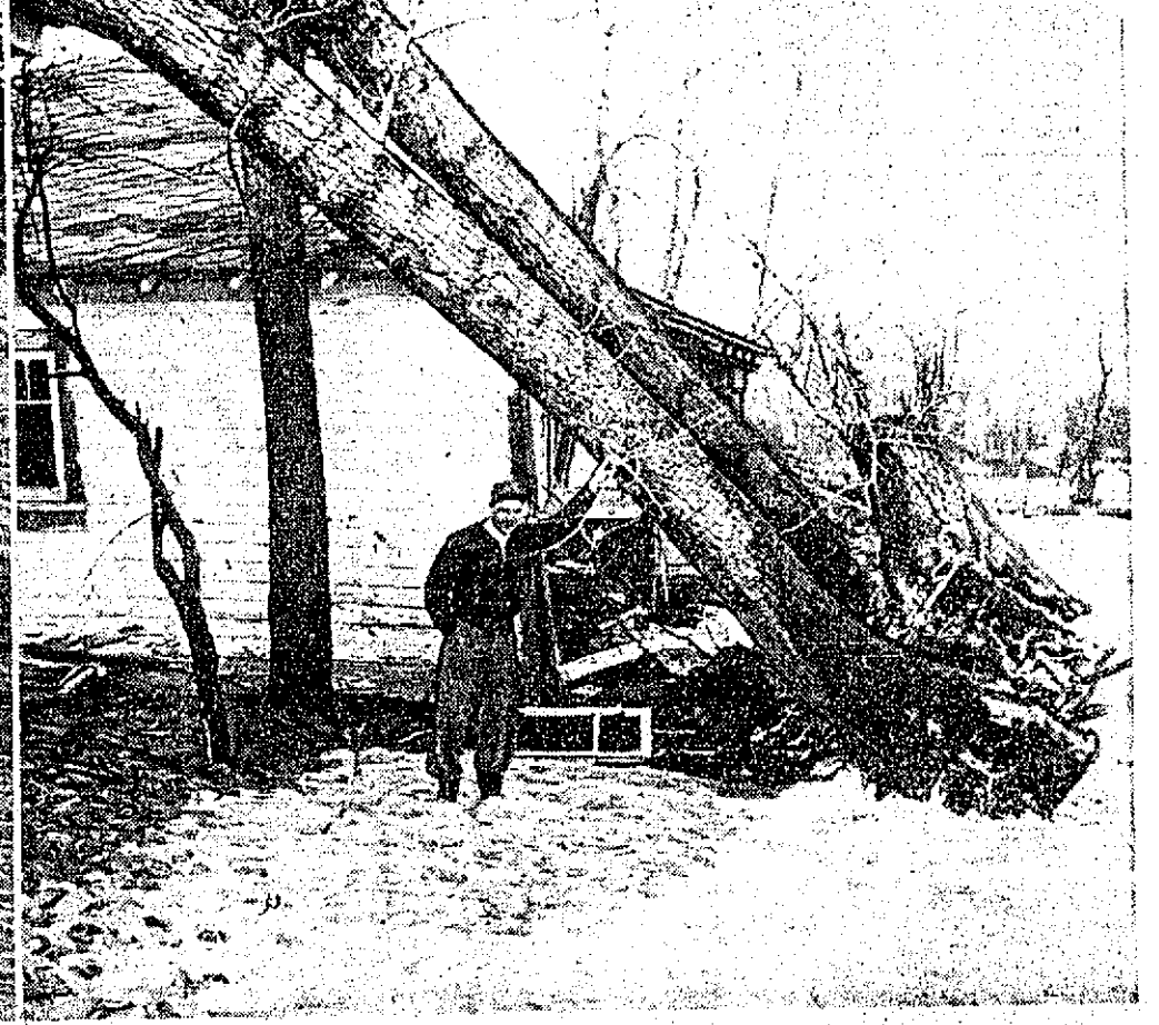
TREES WERE UPROOTED at Lake Promenade, in Long Branch, and many fell over homes, crushing them. Rich farmlands and public utilities from Windsor to 50 miles east of Toronto suffered extensive damage. Wind storm was one of worst in decades